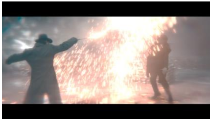
Fig. 3. Grindelwald and Dumbledore were in battle ( Fantastic Beast 3: The Secret of Dumbledore ) (02:00:44)

and Dumbledore fight as can be seen in the following figure.