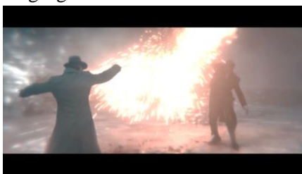
Fig. 4. Grindelwald and Dumbledore conflicted with each other in another atmosphere ( Fantastic Beast 3: The Secret of Dumbledore ) (02:00:48)

The external conflict in this movie occurred in the climax when the real Qilin didn't choose Grindelwald as the new leader and it made him angry and cast a spell on Credence who had spilled his lies. The cast was countered by Dumbledore and it made Grindelwald was in battle with Dumbledore as can be seen in the following figure.