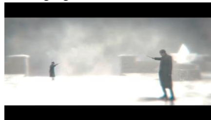
Fig. 2. The other atmosphere of the Eyrie ( Fantastic Beast 3: The Secret of Dumbledore ) (02:01:03)

The location where the event occurred in this movie is the other atmosphere of the Eyrie located in Bhutan when Grindelwald and Dumbledore were in battle which can be seen in the following figure.