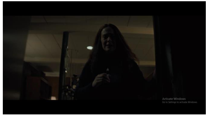
Fig. 4. Diane wants to inject a dangerous liquid into Chloe

The data shows that Diane made a brown liquid and added paint thinner, and then injected it into Chloe.